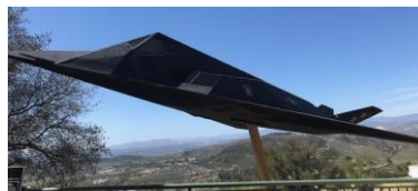
Lockheed F-117 Nighthawk stealth fighter on display just outside the cafeteria window