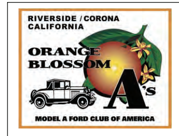
One Pair of Magnetic Signs for Cars = $20 per set