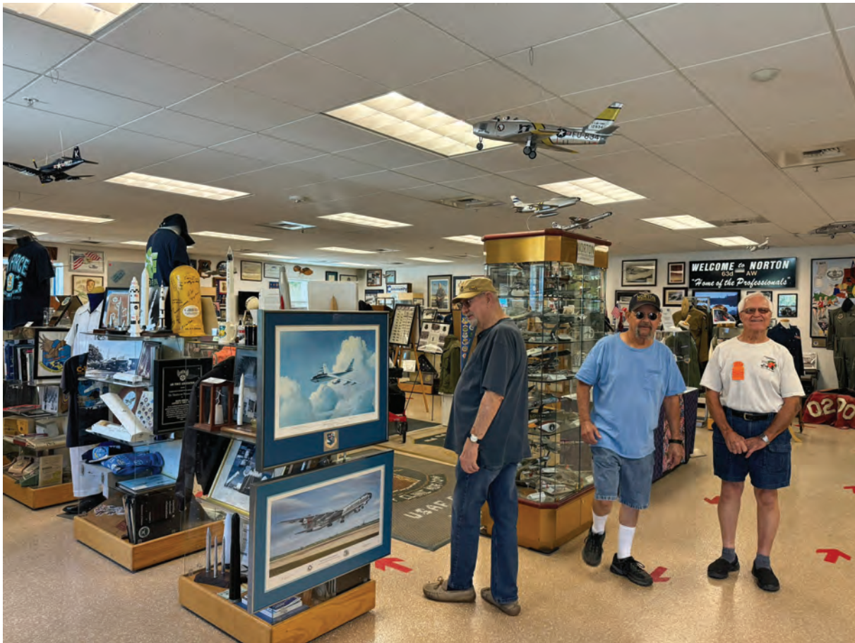
(Page 1) Several Model As of the Orange Blossom Model A Club and the Paradise Valley Model A Club line up outside the Norton Air Force Base Museum.