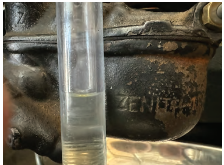
(Below) The fuel level was 1 inch below the casting top!