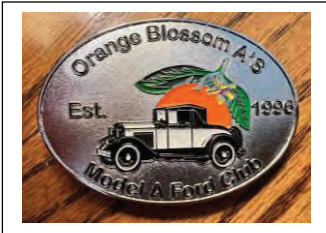
Car Badge (metal) for radiator $25.00