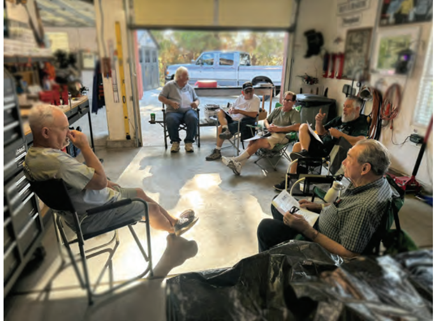
OBA members discuss the pros and cons of LED lights on a Model A Ford.

Two weeks later, on August 24, the club invited members of the Paradise Valley Model A Club of San Bernardino to a joint drive and tour of the Norton Air Force Base Museum. This museum, on the northwest corner of the old Norton Air Force Base, is a great tribute to the base and those who served there while it was an active base (it's now the San Bernardino Airport). A small group of dedicated volunteers does a wonderful job interpreting the history of the base and we're glad we got to see it!