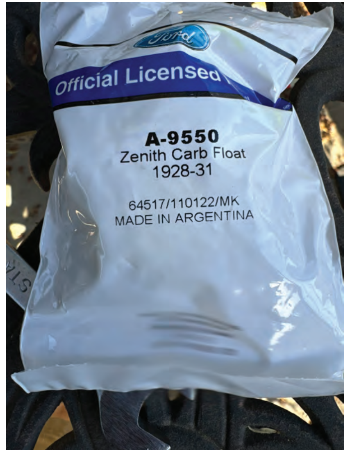
(Above) The non-US made float that caused the issue.

A few people (including the person I spoke to where I purchased the float) said the weight of the float should not matter. Yes, it should, and my experiment proved it. The float, at 20% lighter, was floating ON the gasoline, not IN the gasoline. Think of a floatie toy in the pool by itself. It floats on top of the water, until you get on it and it goes below the water line - it's still floating, but lower. Well, the float was much higher in the carb, and no amount of shim-ming I did would change that fact. With more weight, the float rides lower (where it is supposed to be) and is doing its job now. That said, I'm going to purchase a proper float because I don't know how long the superglue will last in a gasoline environment!